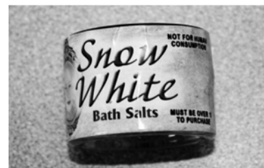
Examples of “bath salts” packaging